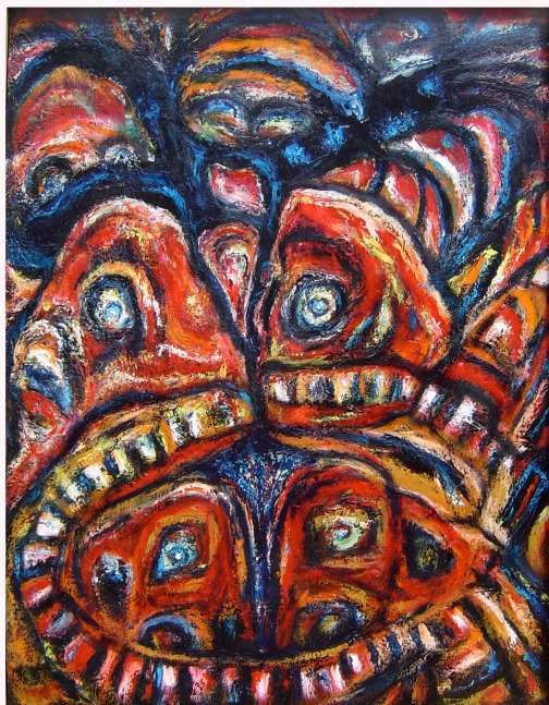
Opéra Sauvage | oil on canvas | 1989